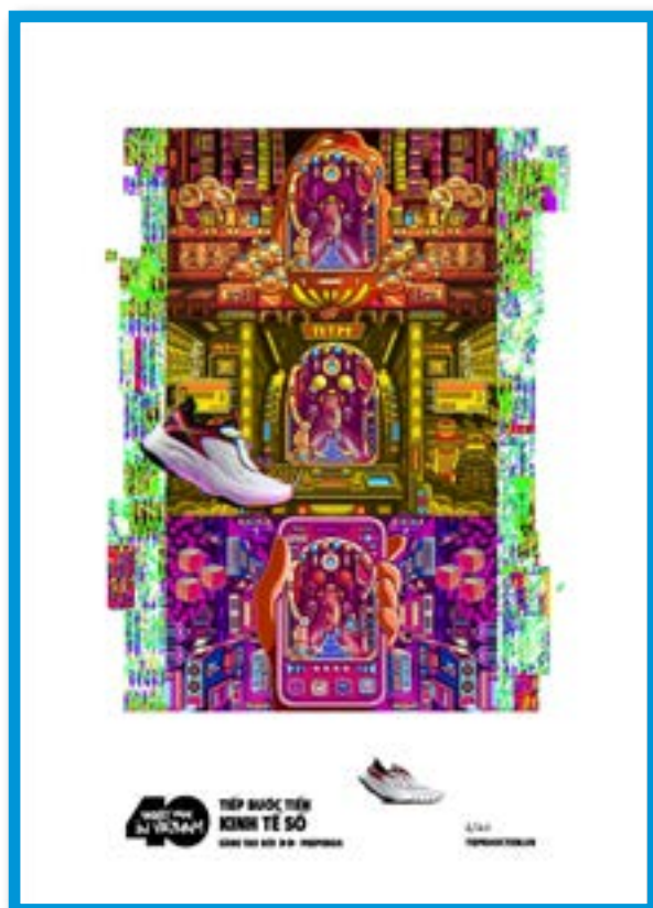
"A Step Forward", as much an expression of national pride as a campaign for a footwear brand.

Over the past four years, each campaign has unfolded as a chapter within a broader brand narrative. We've experimented with various mediums and executions, ranging from short movies to a 1.6-second campaign, from meticulously crafted key visuals to a Xeroxed Fanzine. We have personified shoes into Tinder profiles and even coined a term for gender-neutral individuals in the Vietnamese language, to name just a few. Within these creative explorations, we have consistently preserved a distinctive tone of voice and identity, establishing the brand as a reference in the market.