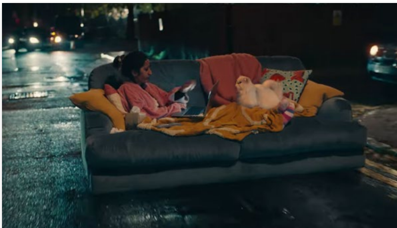
See M&C Saatchi's most recent commercial for the NHS, "From Home to Help", HERE

One of our biggest clients at M&C Saatchi is the NHS. I'm incredibly proud of the work we do for them. And the lives we save.